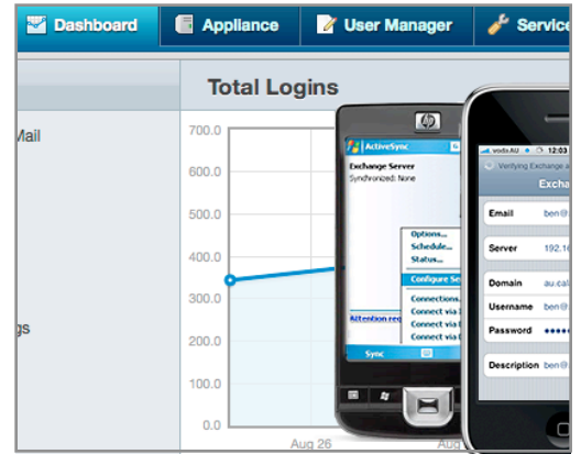
MOBILE FEATURES INCLUDED

The WebMail Client of Atmail supports any existing IMAP server running under a Unix, Linux or Windows systems.